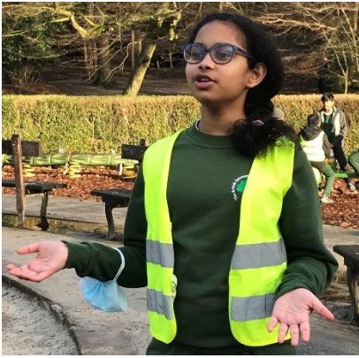
Practising LAMDA in the Park on Friday SKILLS day