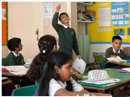
Inspiration strikes in French!